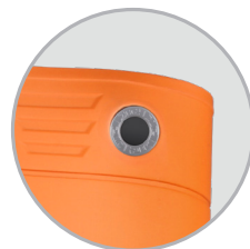
HANGING RING FOR BOOT DRYING